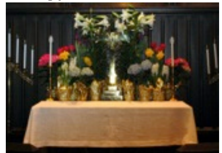
Beautiful Easter Altar Flowers.