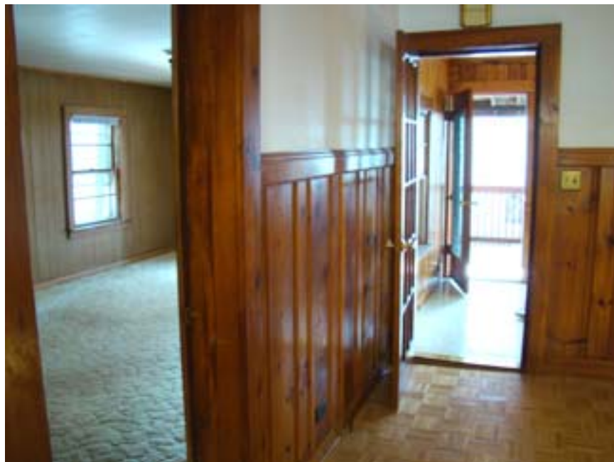
Front Glass Panel Door Open through to Deck. Open doorway at left is entrance to Bedroom