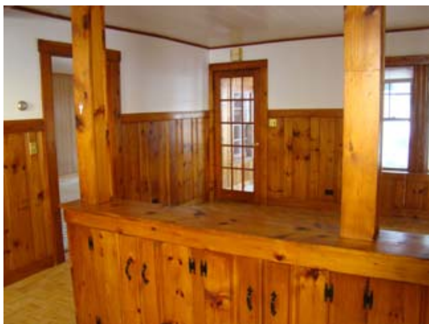
View from Kitchen Doorway of Living Space and doorway to bedroom.