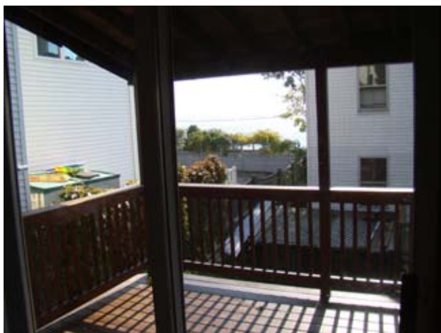
View from inside Bedroom