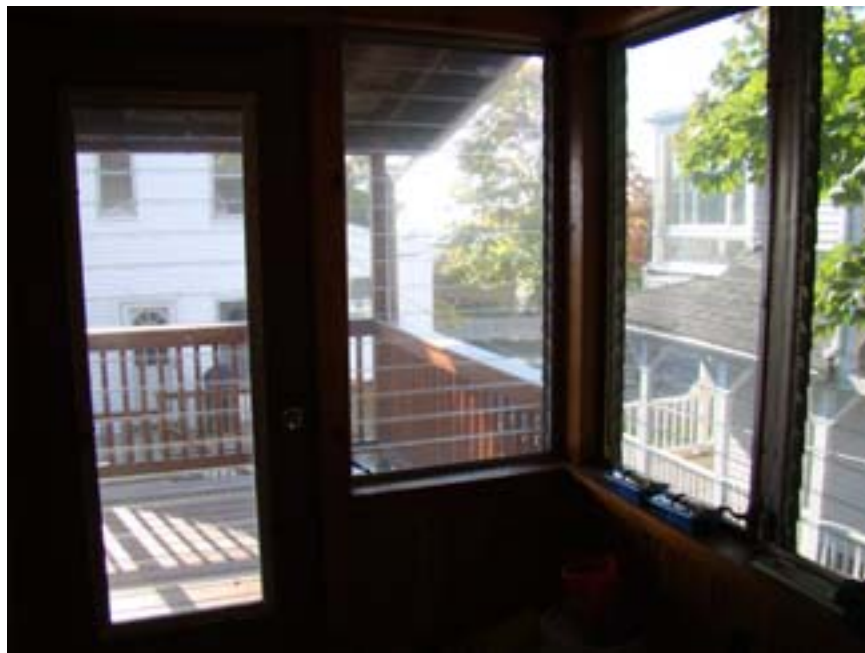
View from Sun Room Entryway