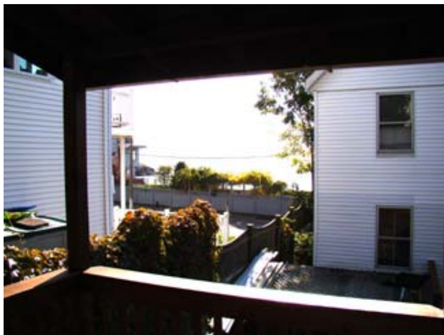
View from Corner of Front Deck in front of Bedroom