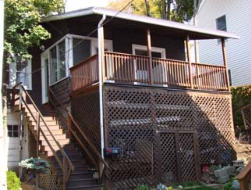
Front of Cottage, Front Stairway to Living Space