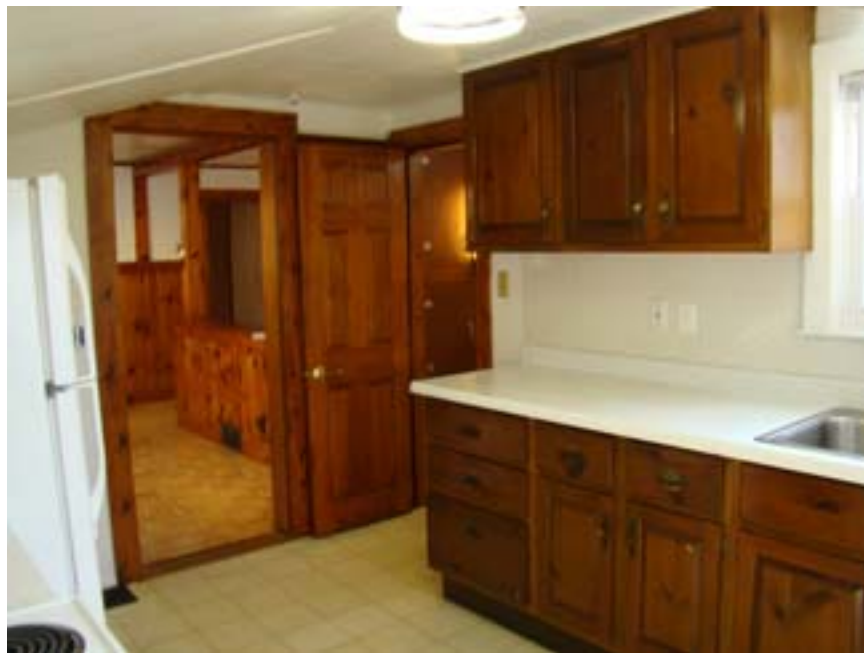
Kitchen Cabinets and doorway to Living Space. Bathroom is at right at end of counter.