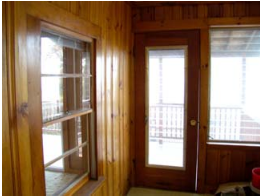
Front Door Opens to Sun Room...Door at Right Opens onto Front Deck of Cottage