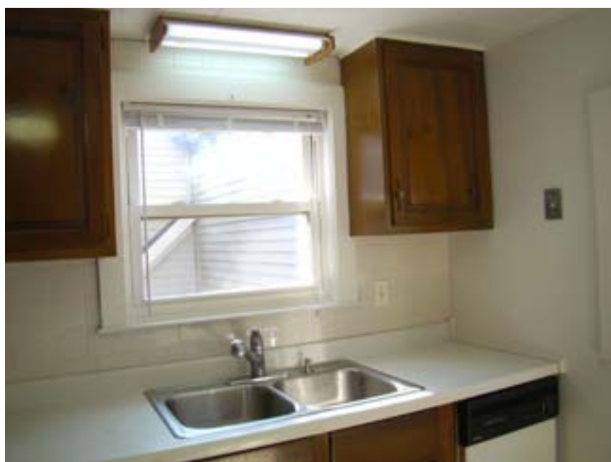
Kitchen Stainless Steel Double Sink with garbage disposal and dishwasher.