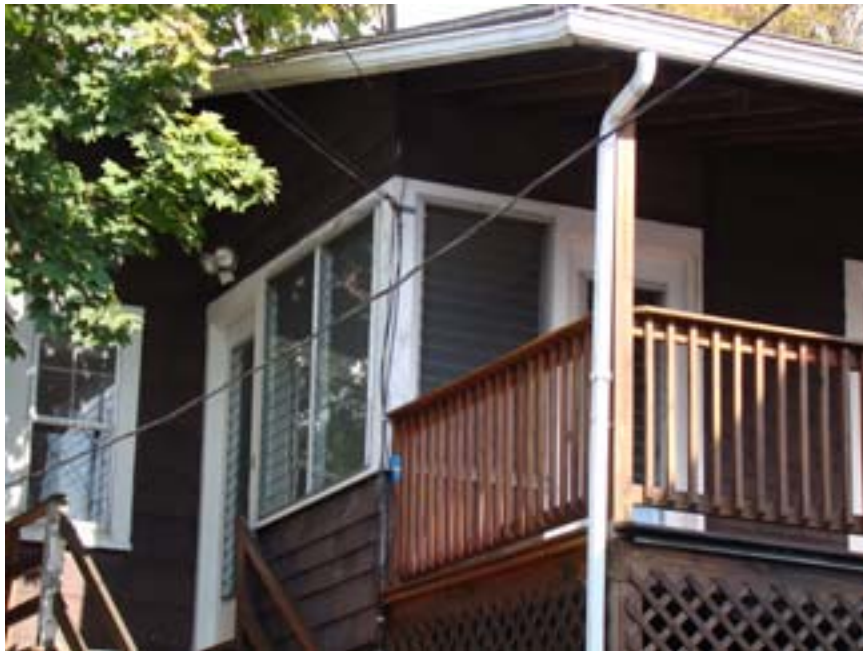
Front Door Entrance to Sun Room and Front Deck