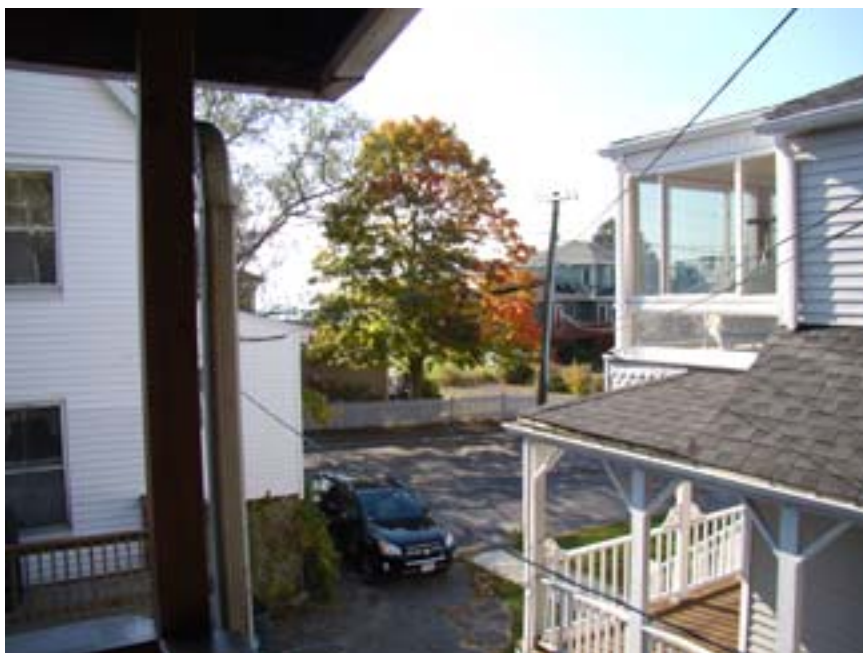
View from Front Door