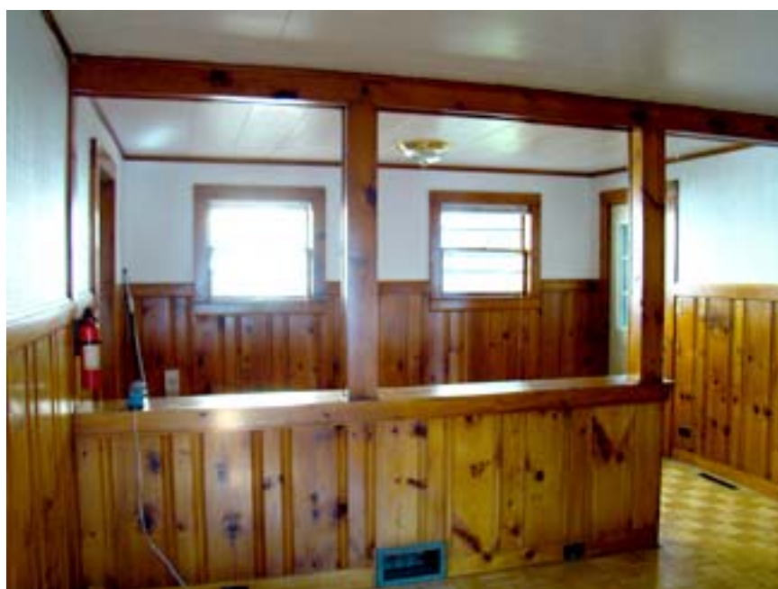
View from Front Door of Living Space