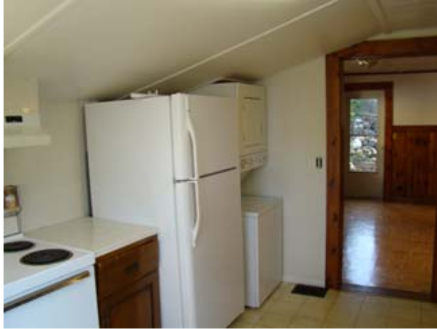
Kitchen: Electric Stove, Refrigerator/Freezer, Stacked Clothes Washer & Dryer