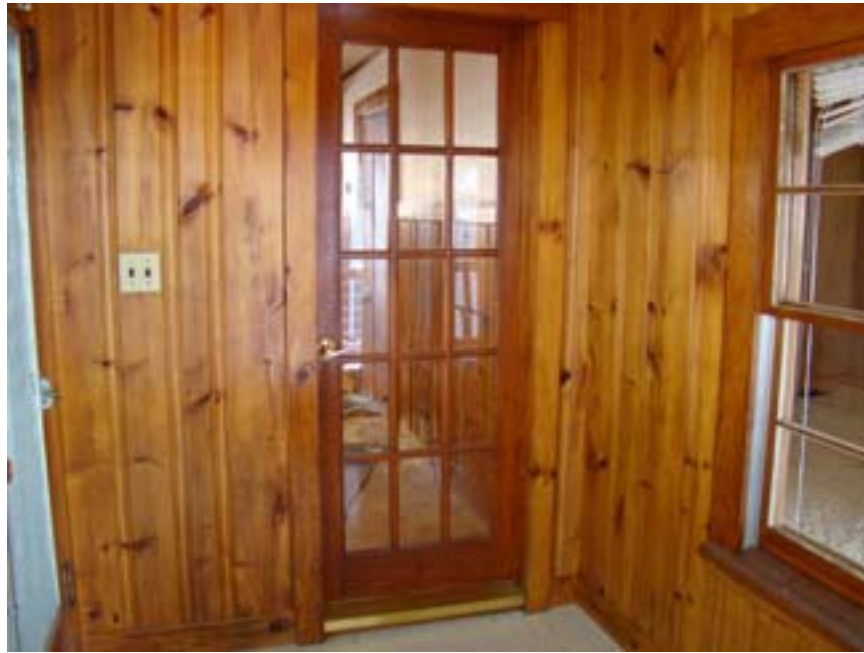
Inside Left of the Front Door of the Cottage, the Glass Panel Front Door opens to the Living Space.