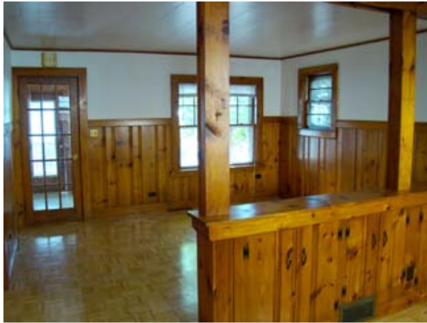
Glass Panel Front Door opens into Living Space from Sun Room Entryway and Front Door