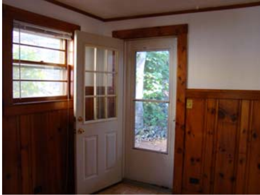
Back Door to Back Deck from Living Space