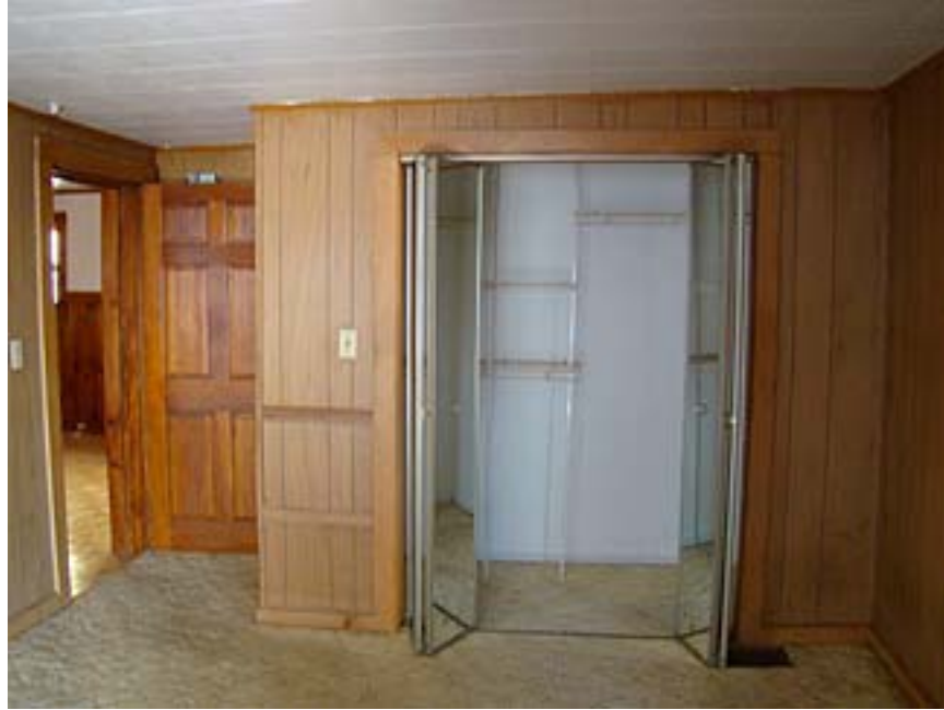
Bedroom with Mirrored Doors on Walk-in Closet