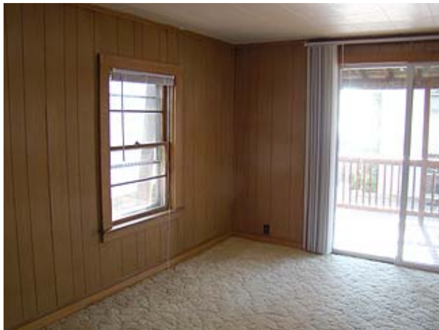
Bedroom Facing Front of Cottage. Slider opens onto Front Deck