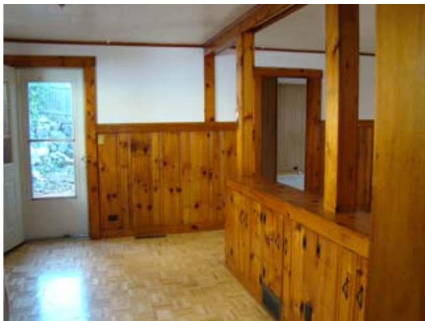
Back Door of Cottage off Living Space with divider looking from kitchen doorway.