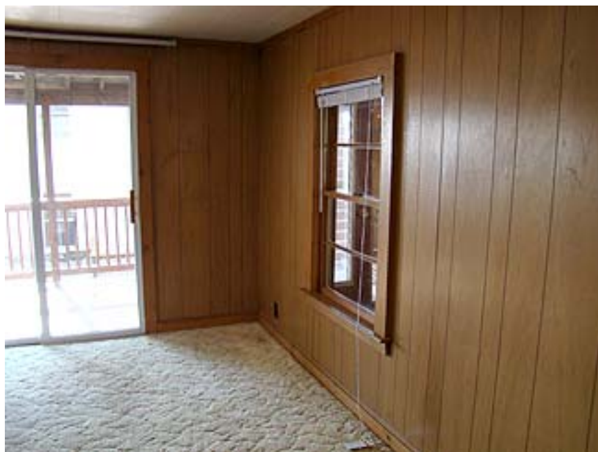
Bedroom, window opens into sun room.