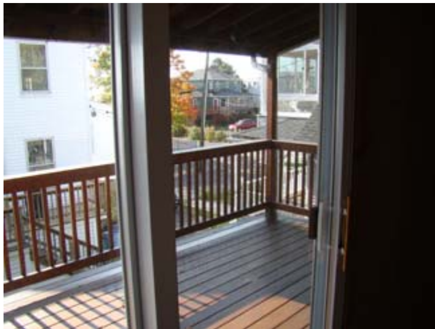
View from Bedroom Slider Door which opens onto Front Deck.