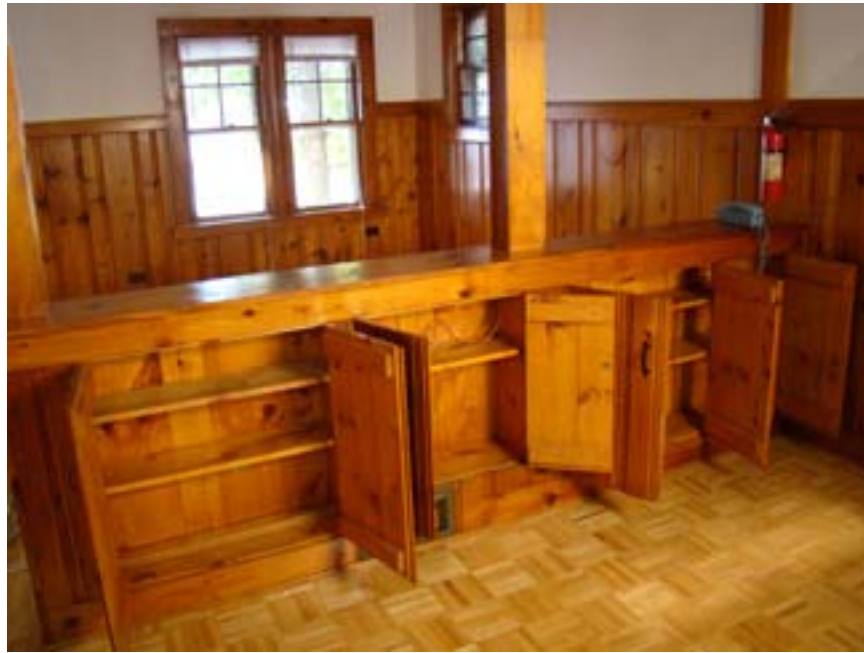
Cabinets in Divider in Living Space