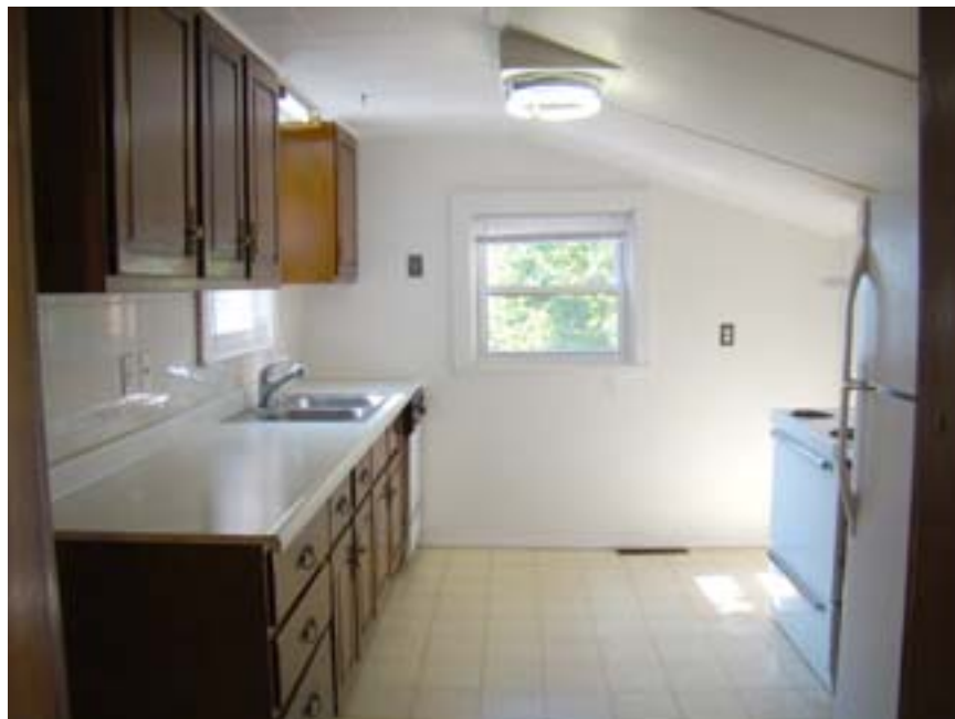
View of Kitchen from Doorway of Living Space. Bathroom is at left. Enter through Kitchen.