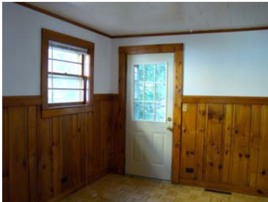
Back corner of Living Space